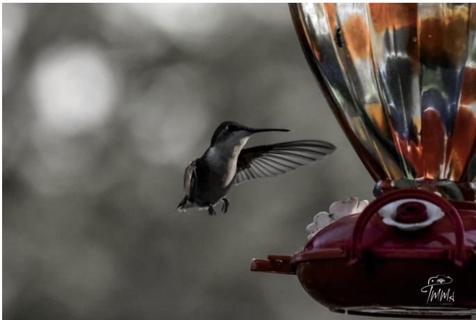
1st Place - Adult Wildlife Category

Keep a lookout for a reminder email in May, before the contest starts, with all the details. We are looking forward to seeing all your special Otter Lake moments.