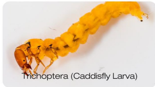
Figure 1 Examples of different benthic invertebrates found in shallow bottom sediments

Lake Stewardship Report Cont'd on page 14