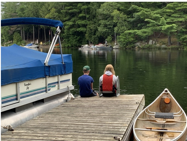
2nd Place - Adult People by Rob Van Geest

Jenn: "Don't even try. We'd come up and find your corpse in some mosquito-infested swamp!"